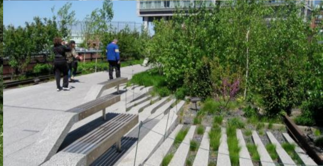
De Villiers Street Linear Park