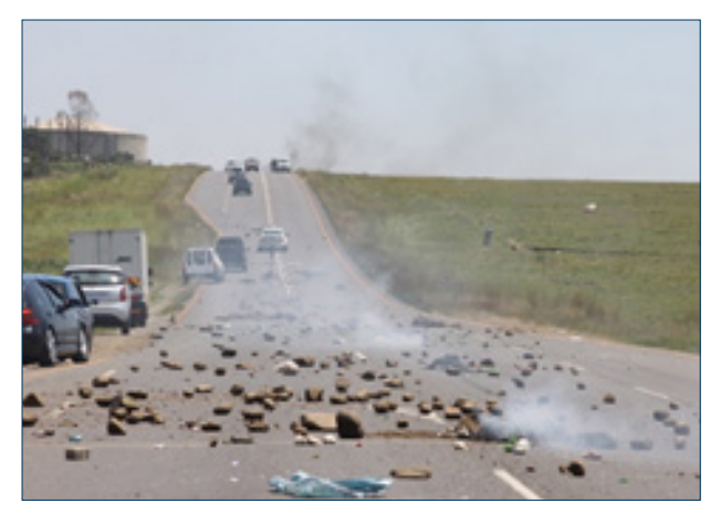
Figure 2: Protesters barricade roads due to poor service delivery in Leandra. The picture to the left shows barricading of roads by the discontented protesters. This exercise lasted for a week, and cars could not pass through. In many ways, the above pictures reflect the high level of dissatisfaction with service delivery and some of the negative effects.

Concerned with the violent protests, the LCC initiated a dialogue between the community and the municipality, aimed at improving social cohesion and communication between the municipality and local citizens. LCC requested Planact to provide facilitation to improve meaningful public participation in Leandra. The social facilitation consisted of strengthening community-based organisations to be able to effectively influence local democracy and local development planning. The GIZ provided financial support to the process. As part of the social facilitation process, Planact supported the compilation of the urban development framework from 2013 until 2014.