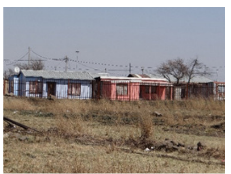
Figure 7: Brick houses