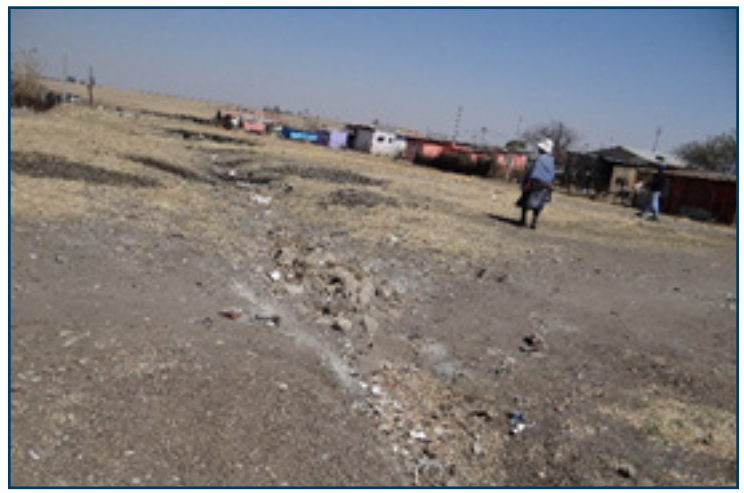
Figure 9: Church structures located close to each other

• Huge competition for space and conflict emanating from different uses, especially between churches and taverns, as they were closely built next to each other. Please see Figure 9 below. The different churches found within the area were Zion Church, Seventh Day Adventist Church and Methodist Church.