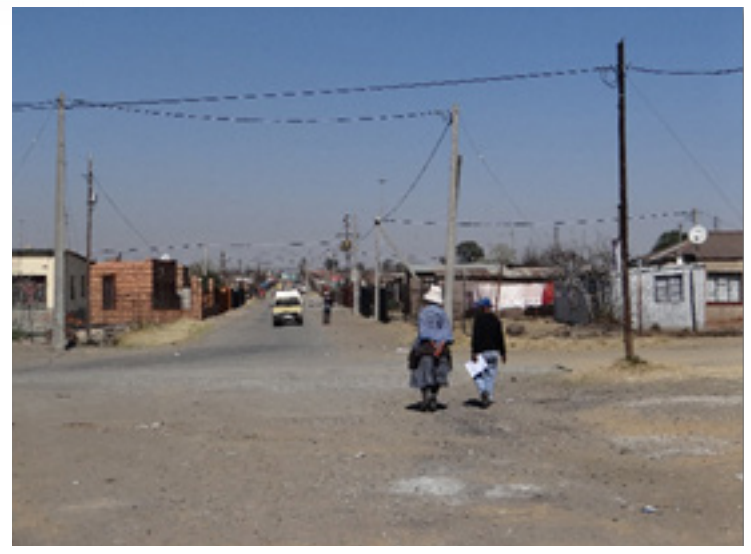
Figure 10: Leandra community members conducting a transect walk.

Comparing the two places where the team walked, one can easily distinguish the difference within the communities. Leslie community is well developed in terms of infrastructure while Extension 16 and the established township have minimal development and relatively less infrastructure.