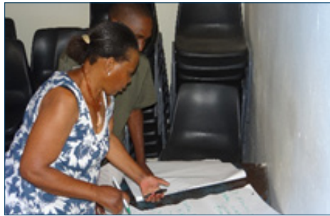
Figure 13: Focus group discussion Mapping exercises