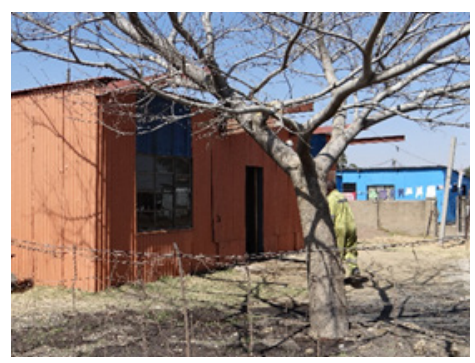
Figure 6: Wood structure

Like most peri-urban areas, Leandra has a high rate of unemployment. The participants discussed this phenomenon. They asked why this was the case when previous studies showed that Leandra is located around mines and close to the towns of Secunda and Springs. Most of the residents of Leandra are unemployed, only a few are employed locally in Secunda or are self-employed. The second identified challenge is the housing backlog in Leandra, and to date this remains a huge problem. The existing housing typology in Leandra is varied. The dominant housing typology mainly consists of zinc and bricks. The brick houses are mostly RDP houses which in most cases have been extended by families either with brick layering or corrugated iron, usually to accommodate members of the extended families. Figures 5, 7 and 8 show different housing typologies and use of materials.