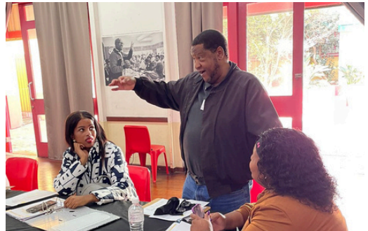
Above: Planact engaging with contractors who are undergoing training through DAG