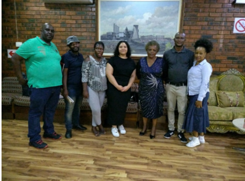
Above: Planact team members with representatives of the Emalahleni Cluster and the Chairperson of the MPAC (in blue dress) in Emalahleni Municipality.

On March 20, 2024, Planact and its partner cluster of communities in Emalahleni, including MASCOM (Masakhane, Spring Valley, Coronation, Mgewana), attended the Municipal Public Account Committee (MPAC) meeting, in Emalahleni Local Municipality. They observed the proceedings from the public gallery.