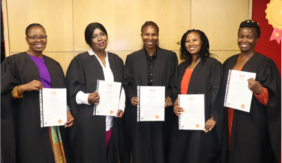
Above: Asivikelane Community Facilitators who graduated with their Higher Certificates in Community Development and Leadership from the University of Johannesburg.

AN EXTENSION OF PLANACT'S WORK IN PARTNER COMMUNITIES