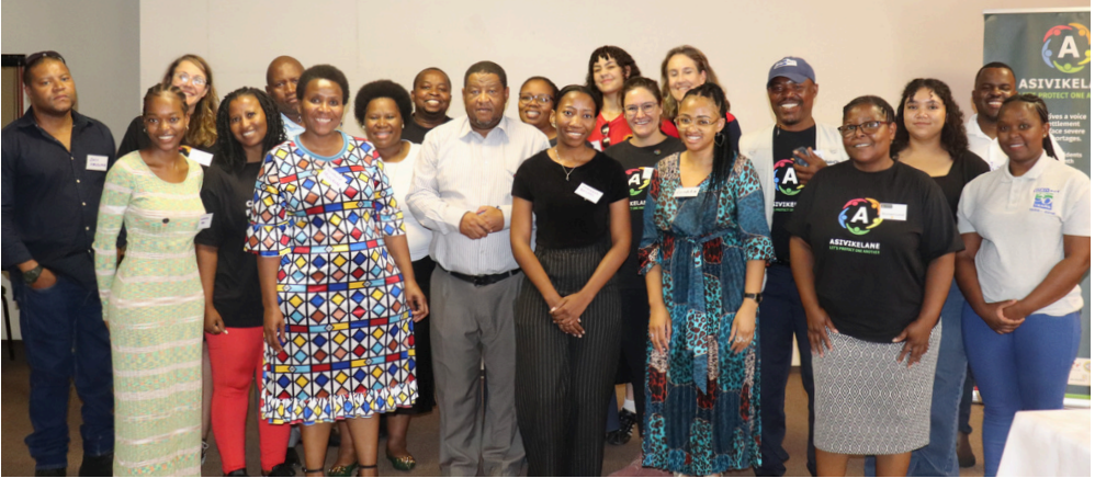
Above: Asivikelane Sanitation Hub stakeholders in the City of Johannesburg comprising of Asivikelane community facilitators, Johannesburg Asivikelane partners and officials from the Environmental and Infrastructure Services Department, Joburg Water and the Human Settlements department.

Asivikelane's Sanitation Hubs aim to address water, sanitation challenges in informal settlements.