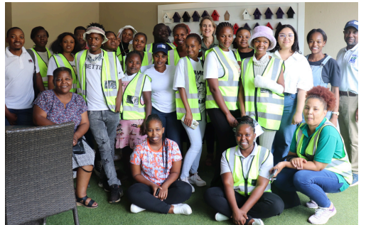
Above: A group picture with the citizen scientists alongside Planact team members.