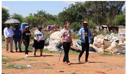
Above: European Union site visit in Kameeldrift with Tshwane Waste Hub partners and City of Tshwane Waste Management Department officials.

The Tshwane Waste Hub aims to determine the necessary adjustments to be made to the draft waste management strategy for informal settlements by the City of Tshwane.