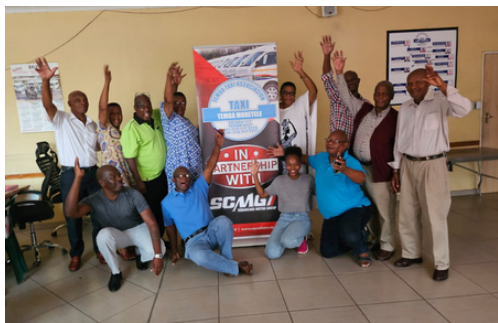
Above: Group picture of members from the Temba Taxi Association alongside Planact team.

The next project steps involve creating a safety plan that aligns with other CoT plans and government initiatives, followed by implementing and testing a key aspect of the plan. If all progresses as planned, the Hammanskraal CBD will soon become a safer place.