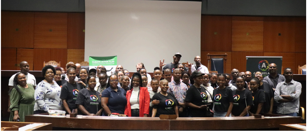
Above: Stakeholders at the Waste Management Hub meeting held at the City of Tshwane Council Chambers comprising of City officials, Asivikelane community facilitators and Planact team members.

Asivikelane's new service delivery Hubs are designed to find solutions to water, sanitation and solid waste problems in informal settlements.