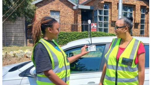
Above: Heat mapping in Garsfontein/ Lynwood area in Pretoria.

Read more at: https://planact.org.za/citizen-science-in-action-in-mitigation-of-city-warming/