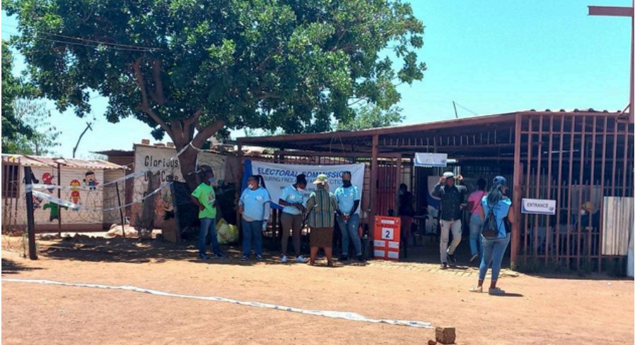
Above: File picture taken during the local government elections in 2021.

On 29 May 2024, South Africa will elect a new National Assembly and new provincial legislatures for each of the country's nine provinces.