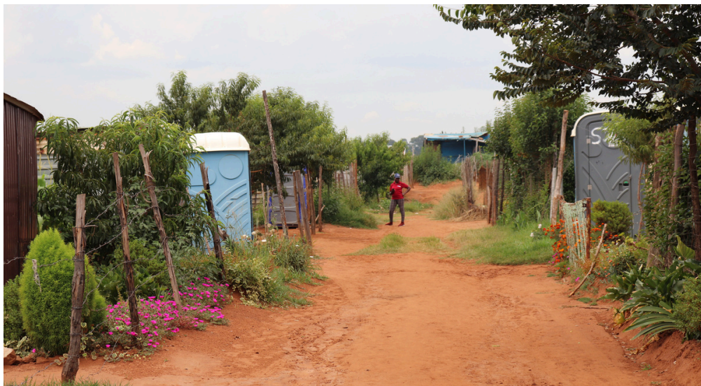
showing a street in Sikonplaa informal settlement, one of our partner communities.