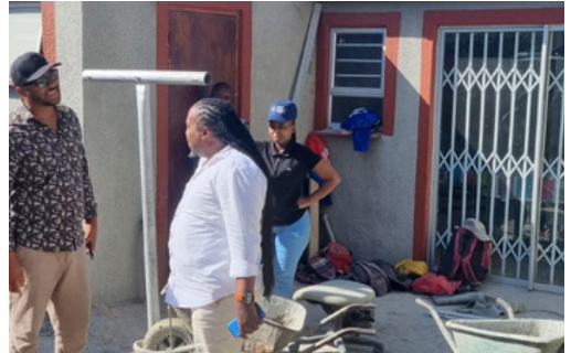
Above: Site visit by the DAG and Planact team to one of the sites worked on by a DAG-trained contractor.

For several years, DAG has successfully implemented the programme in the Western Cape. Partnering with Planact offers the opportunity to expand the programme to the Gauteng region.