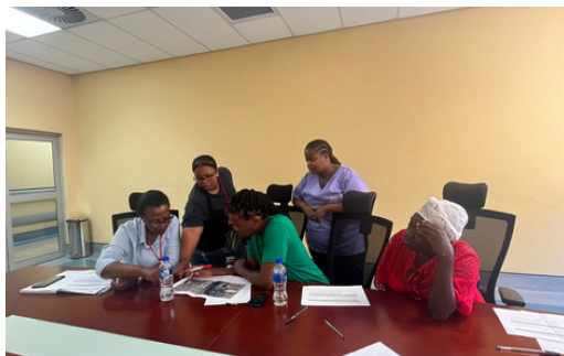
Above: Safety plan stakeholder group engaging in a hotspot mapping exercise.