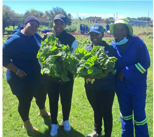
Above: Social Employment Fund participants alongside Planact team members with their harvest from the food gardening project.

Planact has significantly expanded its impact in its partner communities by generating 1000 job opportunities across diverse themes like community safety, food security, digital mapping, gender-based violence prevention, recycling, maintenance, place-making, health, community wellness, and environmental conservation, specifically focusing on Wetland Preservation.