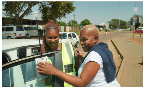
Above: Citizen scientists securing the temperature monitoring sensor to vehicle.