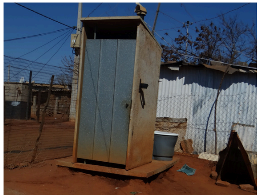
Above: A picture of a ventilated improved pit latrine (VIP) in Thembelihle, south of Johannesburg.

The City of Johannesburg Sanitation Policy (2021) shared by the Environmental and Infrastructure Department presents a number of opportunities for Community engagement and participation in policy implementation.