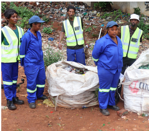
Above: Social Employment Fund participants working under the recycling theme.